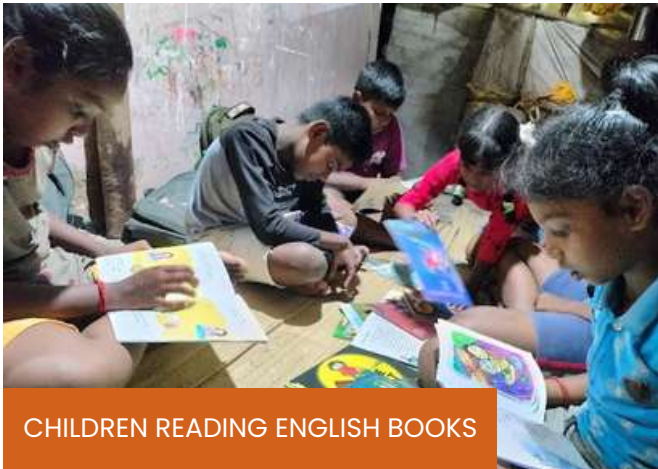
CHILDREN READING ENGLISH BOOKS