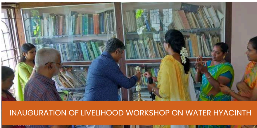
INAUGURATION OF LIVELIHOOD WORKSHOP ON WATER HYACINTH