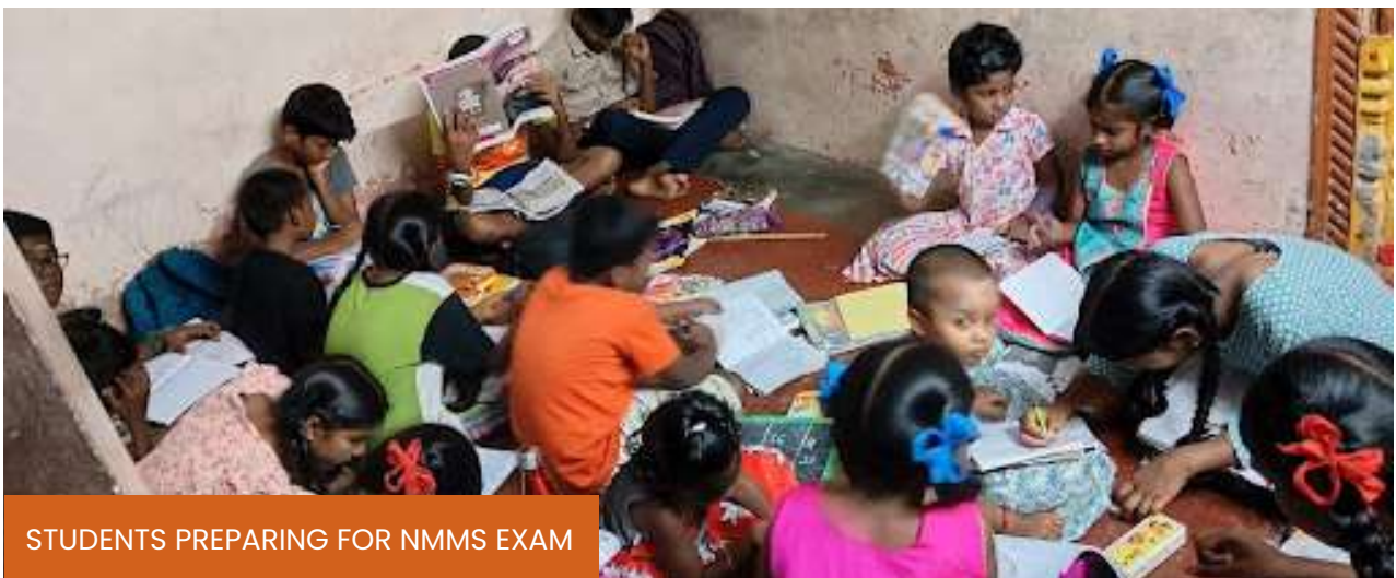
STUDENTS PREPARING FOR NMMS EXAM

The National Means-cum-Merit Scholarship (NMMS) is a prestigious national-level competitive exam designed to support 8th-grade students from Government and Government-aided schools with financial assistance for their higher education. Our study centre students, coming from government schools, have actively applied for this scholarship and are diligently preparing for the exam. Alongside NMMS, they are also focused on their annual examinations, equipping themselves for academic success with determination and guidance.